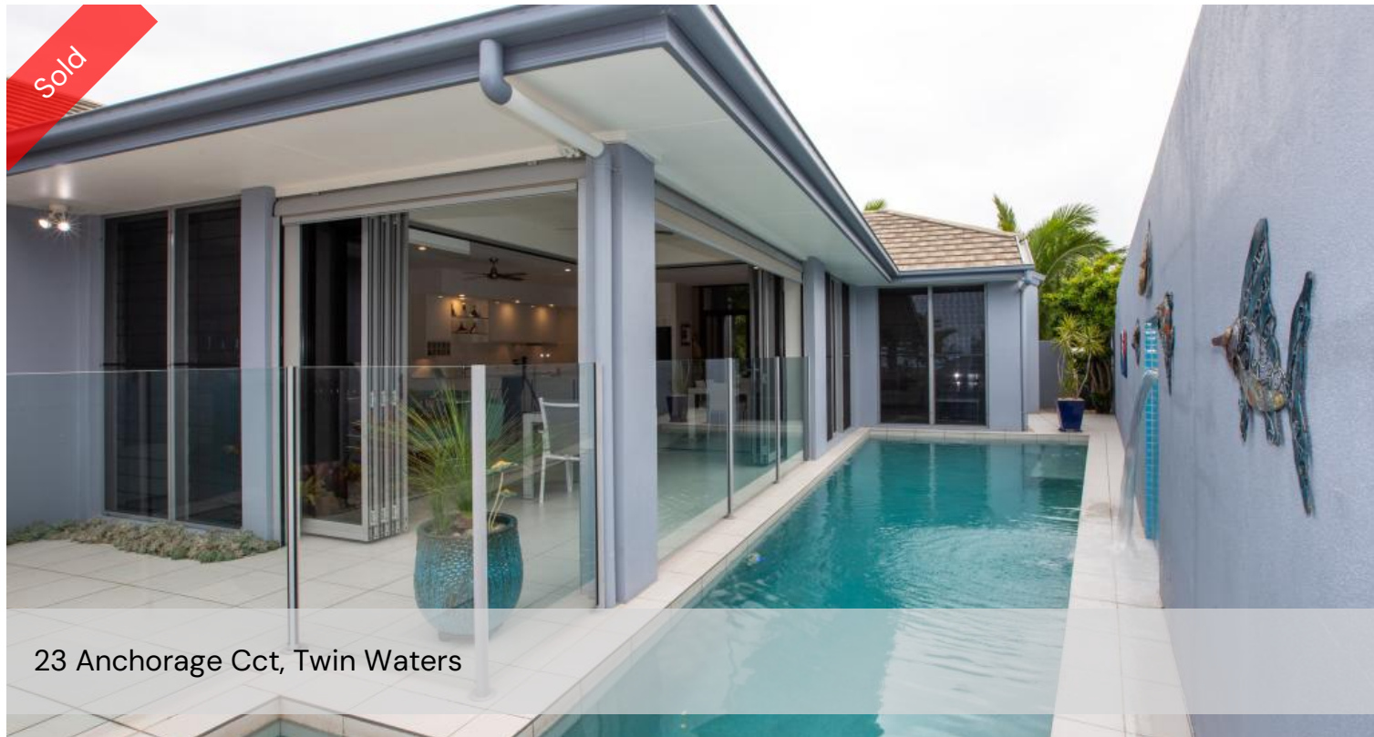
23 Anchorage Cct, Twin Waters