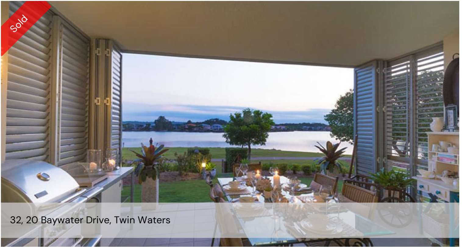
32, 20 Baywater Drive, Twin Waters